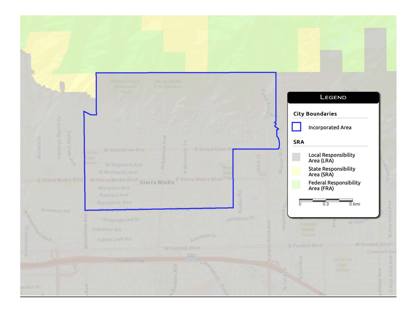
Figure 3-1 State Responsibility Areas