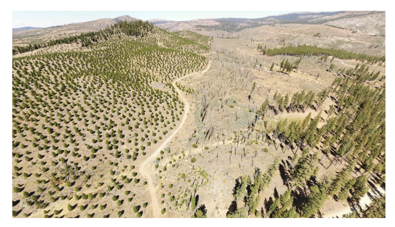
Figure 5 - USFS (right of road) and private land (left of road) boundary. The change from forest to shrub can be detected by the existing Post Wildfire Vegetation Monitoring System.

Step 5-Plumas County Field Case Study of Stream Vegetation Condition Overview: Within Plumas County, within at least 3 wildfires (2021 Dixie Fire, 2020 North Complex, and 2007 Moonlight Fires), stream vegetation conditions will be imaged using a UAV. Within these fires, at least 9 perennial and 9 ephemeral streams will have additional aerial 360 images taken to assess current condition of riparian zones in burned areas along private and public land boundaries (Figure 6). Use of a UAV allows crews to view and assess stream areas without entering potentially hazardous burned forests or disturb potentially fragile ecosystems. These 360 view images can be embedded in a map, allowing users to view current aerial imagery, vegetation type, and ground conditions via the UAV image. SIG has used Mavic Pro Quadcopter UAVs in this area on past projects to map vegetation at high resolution;an example of imagery collected is available here (UAV Image Data