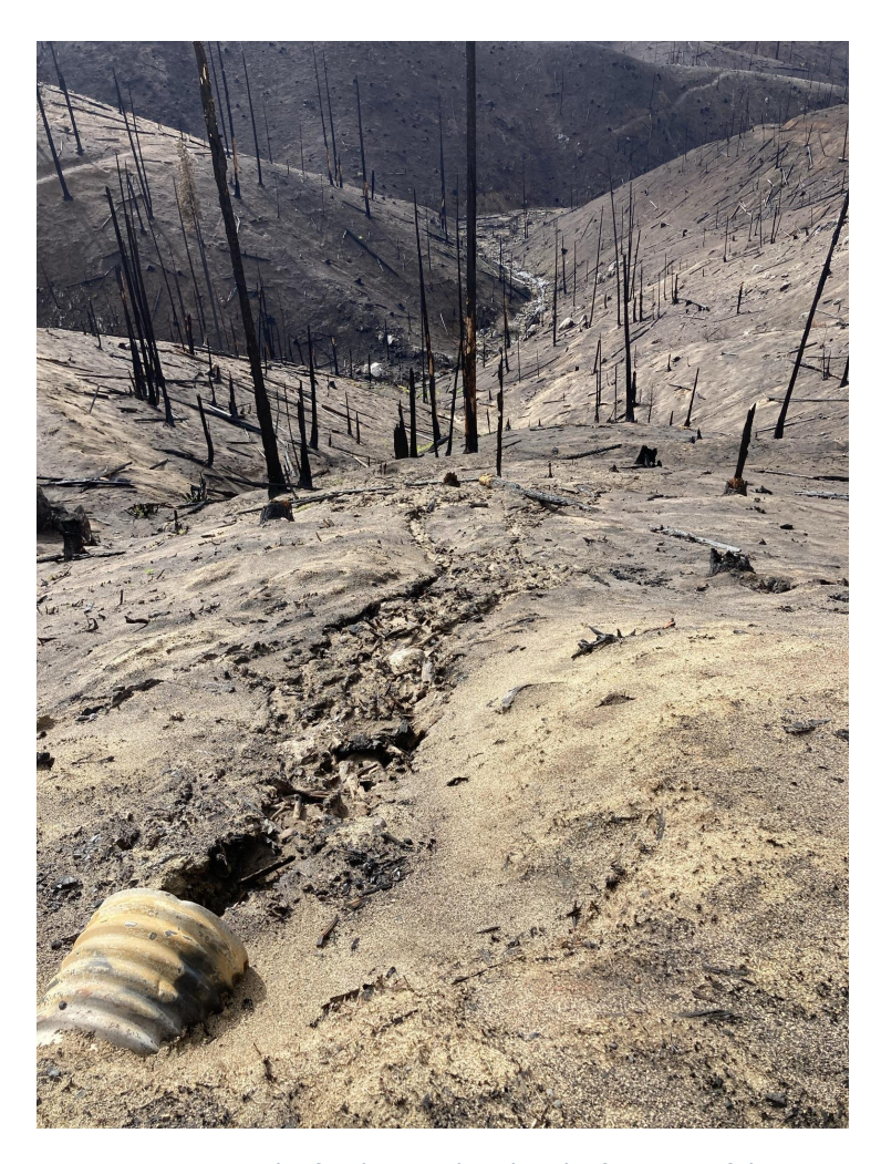
Figure 6 - East Branch of Lights Creek within the footprint of the 2021 Dixie Fire. This area also burned in the 2007 Moonlight Fire.

Step 6-Fire History, Fire Hazard, CurrentVegetation Cover Type (Plumas County) by Ownership Type and, Where Available, Past Management Report. The fire history (burn severity since 1984), fire hazard (flame length and fire type), and current vegetation type derived from Steps 1-5 will be summarized by ownership type (private, public, state, other) using the current available California Protected Areas Database (https://www.calands.org/). Where geospatial data is available via FACTS, Calfire Timber Harvest Plans, and other publicly available treatment datasets, these data will also be summarized by vegetation treatment type (prescribed fire, fuel treatment, post fire tree removal, or other vegetation management) and, if available, inside and outside of areas reforested after wildfire. As a contributor to the Million Acre Strategy, SIG is currently working with the Forest Management TaskForce to aggregate all treatment data. If this data is publically available at the start of the project, we will utilize it for the treatment analysis. It should be noted that this dataset is aggregated back to 2018. As such, we will primarily focus on effects of recent treatments. Rob York (2017) completed the EMC Project