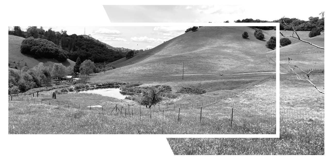
CalVTP Project I.D. Number 2022-19