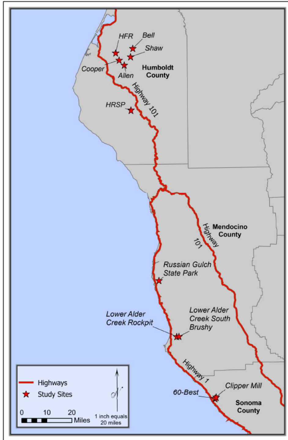
Figure 1. MAMU Study Site Locations