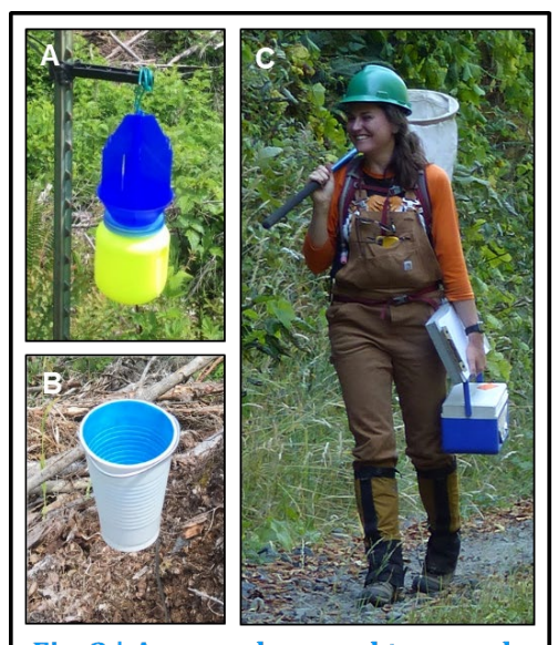
Fig. 3 | Approaches used to sample forest bees in this study. We will employ the use of (A) blue-vane traps and (B) colored pan traps that target bees, along with (C) direct hand-netting of bees from flowers. Note that although a blue pan trap is shown, white, yellow, and blue pan traps will be used to sample bees.

Immediately prior to sampling bees with blue vane and pan traps on each site, we will undertake handnetting and floral resource surveys. We will hand-net insects during favorable weather conditions (i.e., light or no precipitation, air temperature \geq 12.5° C, wind <10 km) along the transect. We will net all bees observed making physical contact with flower reproductive components while recording the plant from which each bee is obtained. The transect will be sampled for 30 min (15 min in each direction) by walking at a constant pace using a stopwatch, with the stopwatch paused when processing specimens. Once netting is completed, we will count and record the species of every flowering stem, number of stems, and number of blooms per stem within the transect to quantify floral abundance and floral diversity. If blooms are too numerous to count individually, we will estimate into bins of 50. We will sample floral resources during each sampling round in both years (i.e., 6 sampling periods) to quantify variation in floral resources across each season and between years.