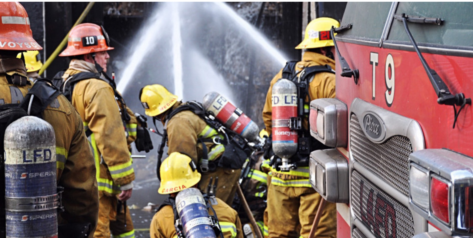
Los Angeles Fire Department responding to a structure fire.

The Los Angeles City Fire Department was established on February 1, 1886. Thirty firefighters, most of them former volunteers, were hired to man four leased firehouses. In addition, volunteer units were retained in the less populated areas outside the central city, including the San Fernando Valley. From the beginning the Department was an innovative, progressive agency which sought to secure the latest equipment, utilize the latest techniques and to develop better methods for fire fighting and prevention.