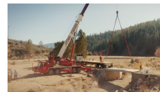
Figure 1. Bridge constructed using CNCs from woody biomass, Yreka, CA.

CNCs are cellulose-based nano-sized particles (3-20 nm wide and 50-500 nm long) that are much smaller than conventional cellulose fibers used in concrete, and even smaller than cement particles themselves. Figure 1 shows a transmission electron microscope (TEM) image of CNC produced from the CNC pilot plant located at the US Forest Service, Forest Products Laboratory. A wide range of applications are being investigated to utilize CNCs.