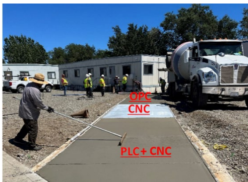
Figure 3. Field placement of mixtures 1) OPC (top slab in the picture) 2) OPC+CNC 3) PLC+CNC (bottom slab in the picture).