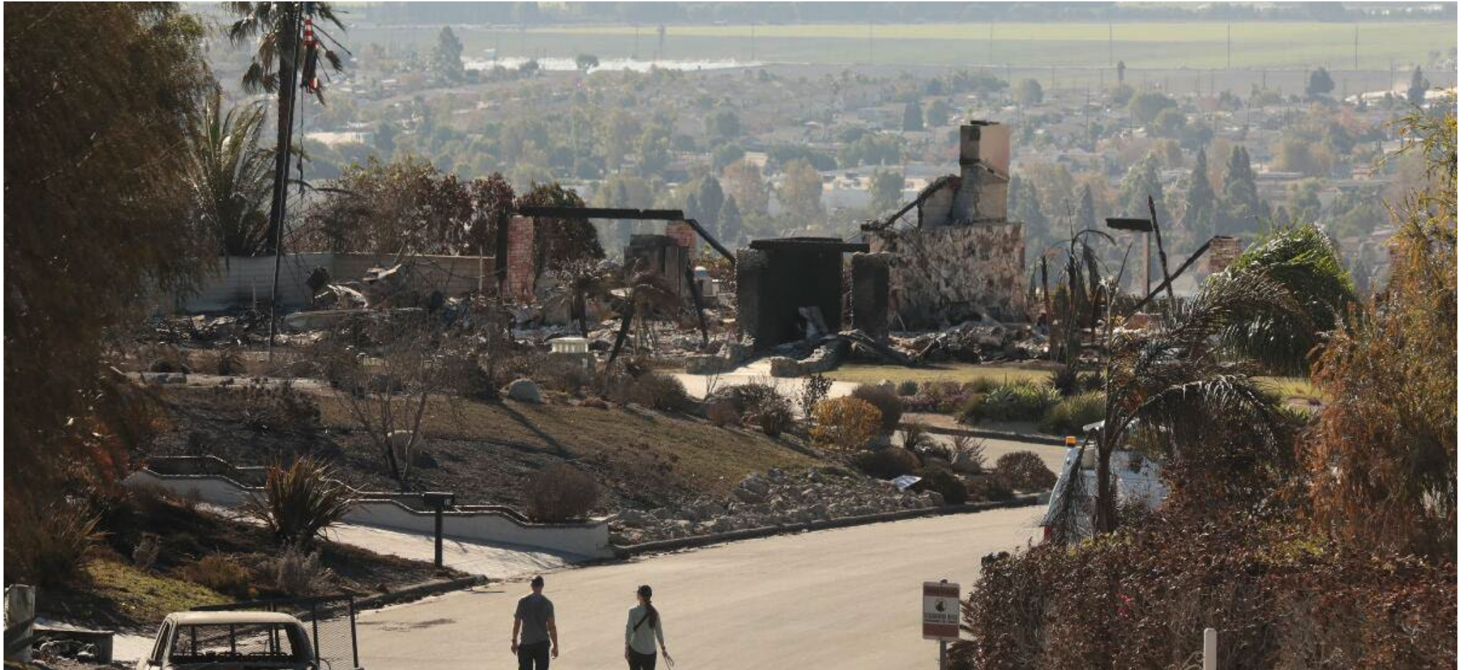
Mountain Fire 2024