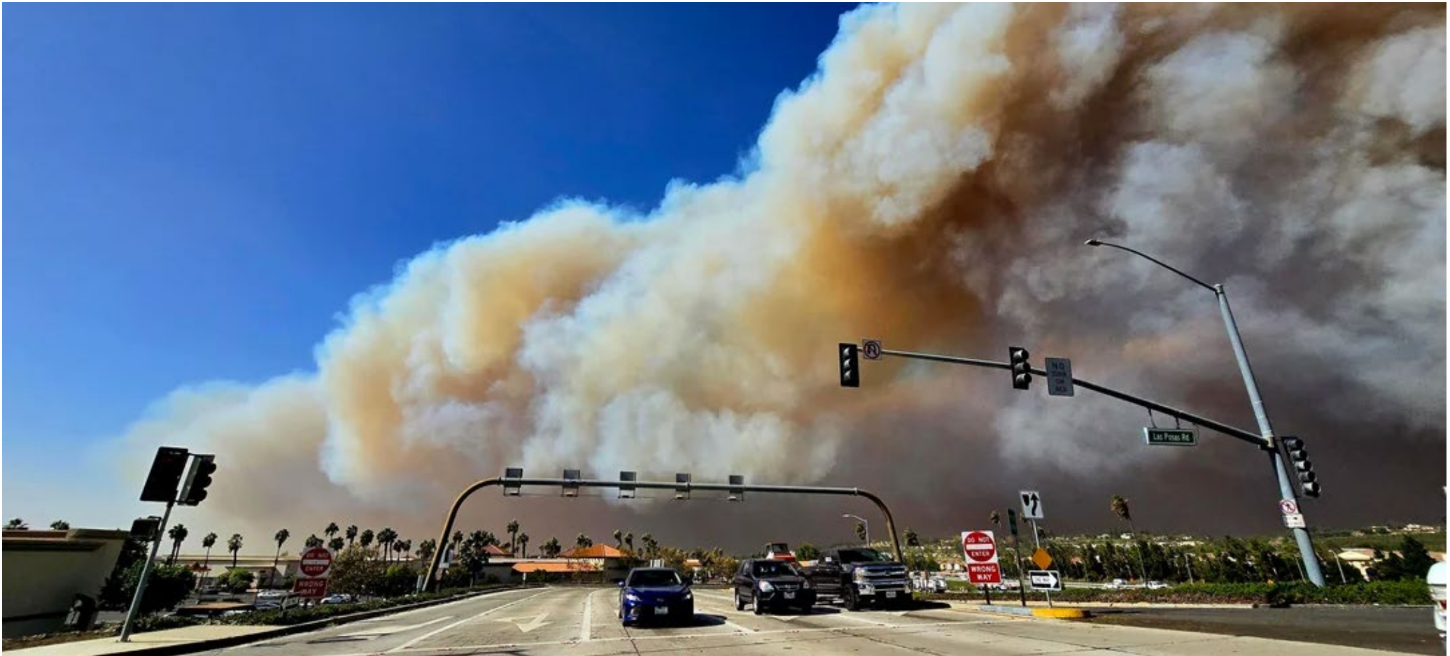
Mountain Fire 2024