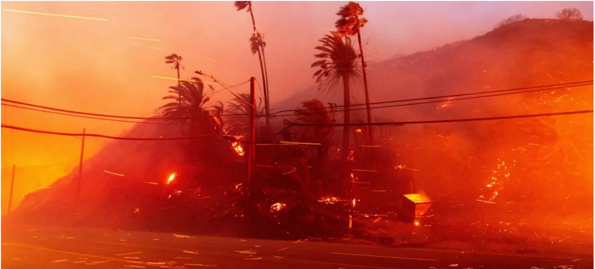
Palisades Fire 2025