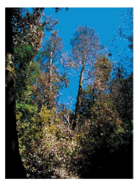
Photo 1. Forest in Marin County with tanoak trees killed by Phytophthora ramorum.

The symptoms of Sudden Oak Death can be dramatic (Photo 1), as with the mortality of large and small tanoaks, or subtle (Photo 2), such as leaf spots on California bay laurel. The nature and progression of the infection varies in each host species, and even within a given species. P. ramorum symptoms are difficult to distinguish from several other common diseases. Foresters may be more confident in their preliminary diagnosis and the need for laboratory analysis if they observe multiple external and inner bark symptoms as well as symptoms on other hosts in the immediate area. If you see several symptomatic host plants (Photos 3 & 4) next to bleeding oaks and tanoaks (Photos 5 & 6) you may be in an infested area.