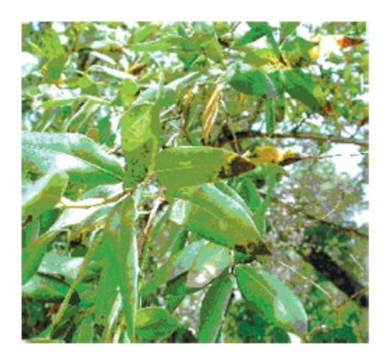
Photo 2. California bay laurel (also called pepperwood, or Oregon Myrtle) showing leaf spots typical of Phytophthora ramorum.