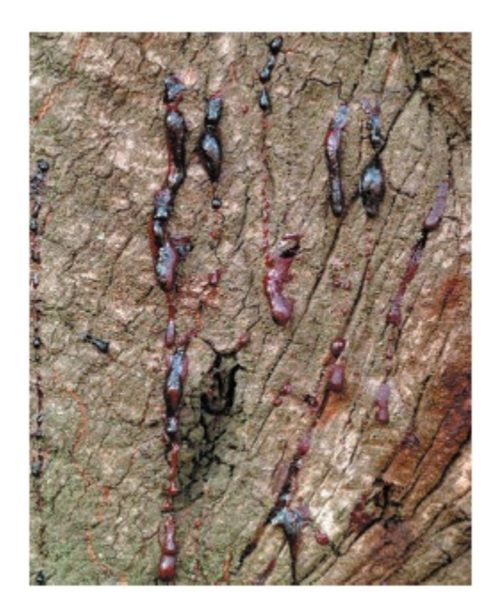
Photo 5. Bleeding cankers on a coast live oak trunk.