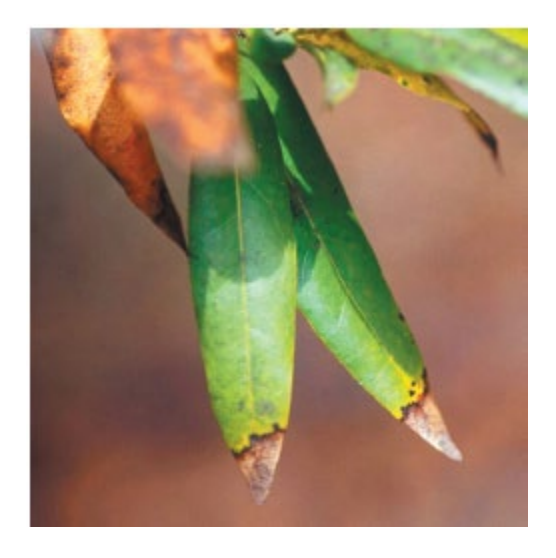
Photo 3. Bay laurel leaf spots.