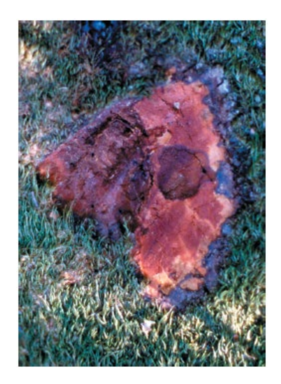
Photo 7. Canker under bark on coast live oak trunk.