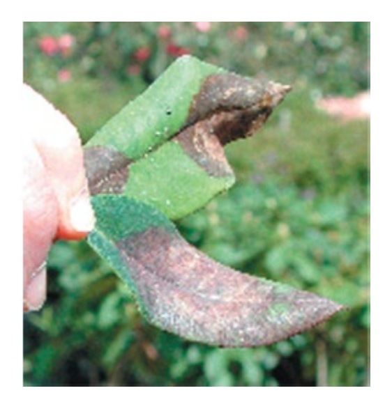
Photo 4. Rhododendron leaf spots.