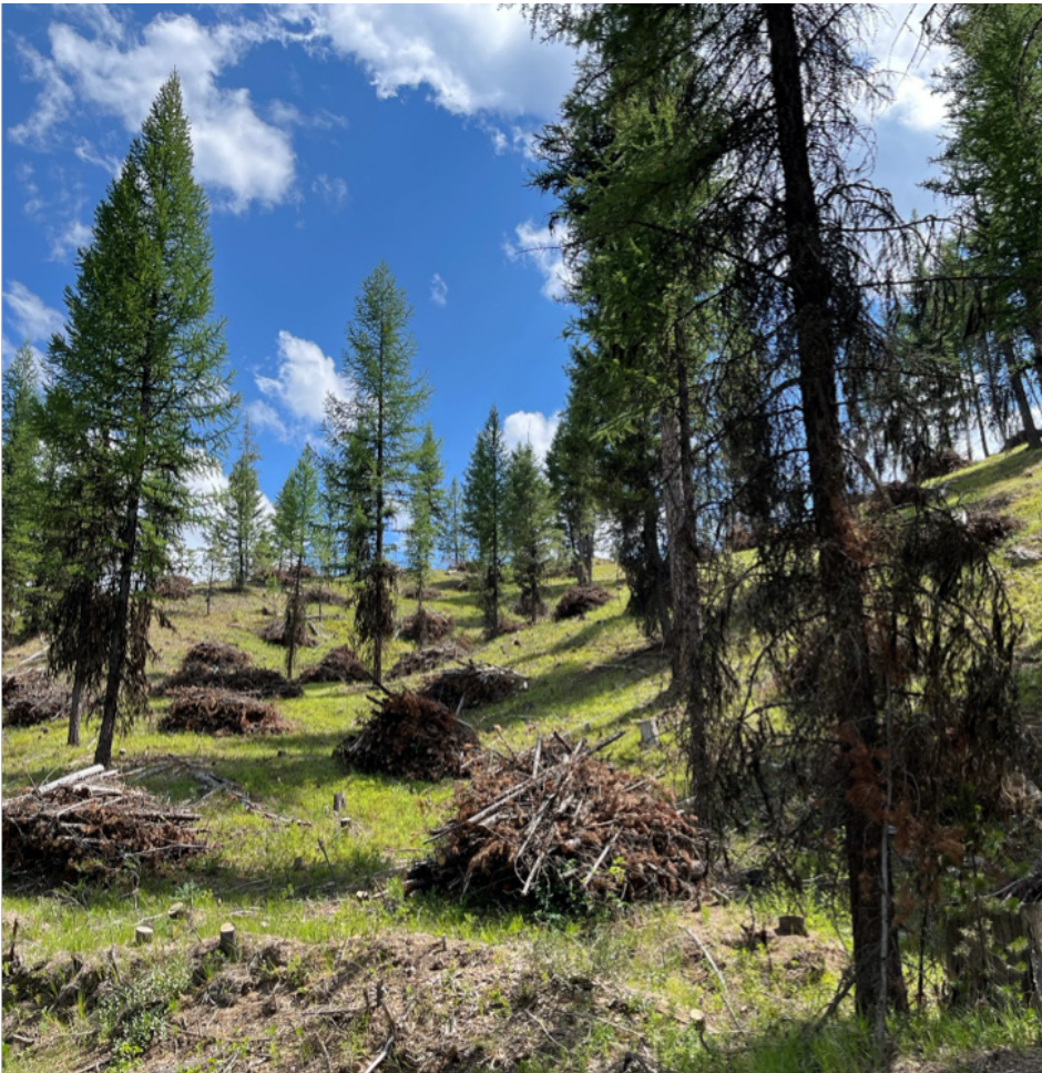
Hand-built piles on the Umatilla National Forest.

One concern with burning slash piles is soil heating, which can kill microbes, change nutrient availability, and destroy soil organic matter. Soil heating after pile burning may also result in loss of a seed bank or increases in invasive plant cover. Hand-built piles created for biochar production are generally simple to construct, are not costly to implement, and do not result in detrimental soil impacts, but may require land managers to adjust from traditional pile construction and burning methods to biochar-generating piles. The focus of the guide below is on hand-built pile construction.