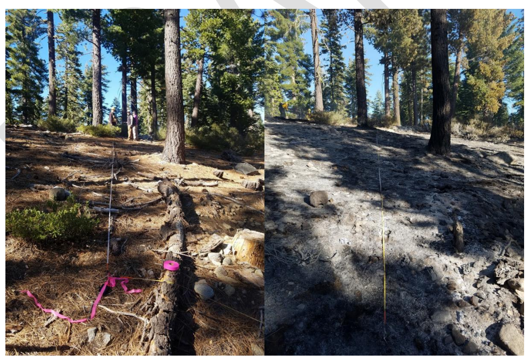
Pre- and post-fire measurements of fuels at Sugar Pine Point State Park, October 2018