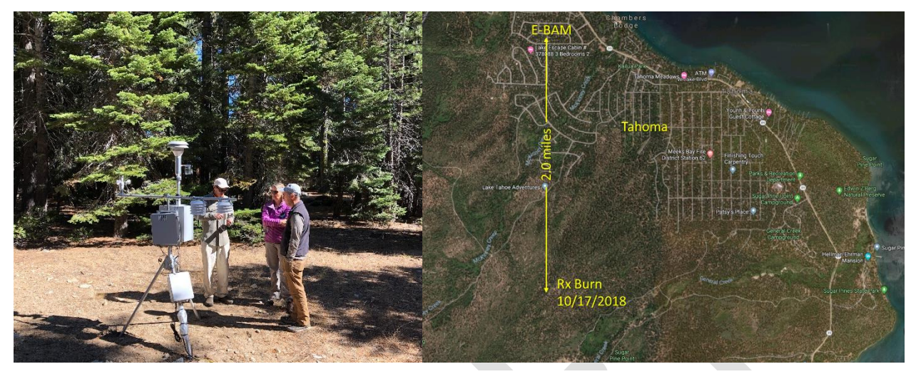
E-BAM air quality monitoring unit deployed near Sugar Pine Point State Park, October 2018