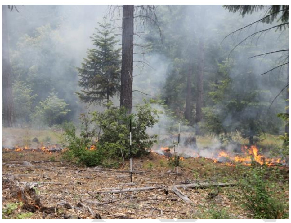
Rate of Spread measurements during prescribed fire, Doaks Ridge, July 2018.