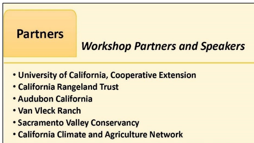
Figure 1. Partners, Sponsors, and Speaker Affiliations for RMAC 2024 Annual Educational Series Workshop

speakers and attendees. Speakers, partners, and sponsors of workshops and field days spanned a wide range of private industry, governmental agencies, and non-governmental agencies ( Figure 1 ).